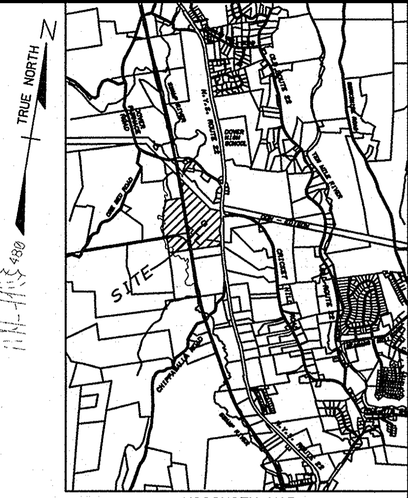
VICINITY MAP SCALE: 1" = 4000'